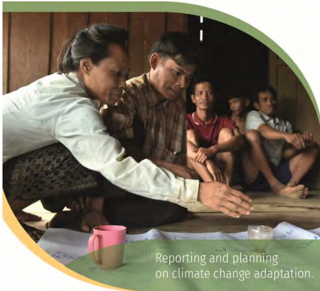
Reporting and planning on climate change adaptation.