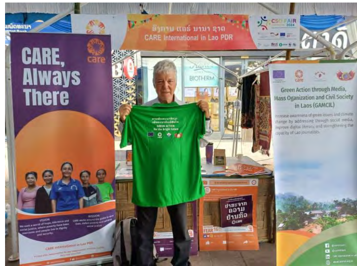
Exhibition of Achievements and Products at the National CSO Fair 2024