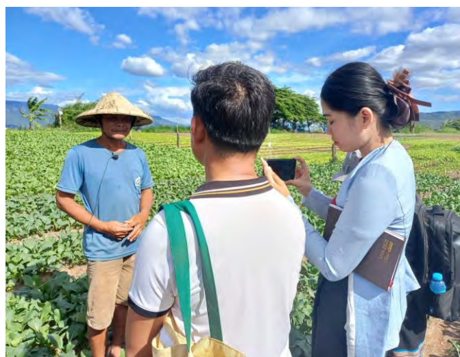
Training workshop for Lao journalists nationwide

In this training, Lao journalists practiced and learned about reporting in a new, concise but comprehensive format, reporting on green news, finding reliable sources, writing stories about green issues, taking interesting photos, using the Canva application