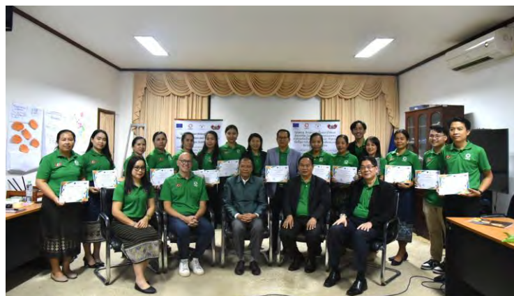
The Training of Trainer Workshop "Green Issues Reporting for Lao Journalists"