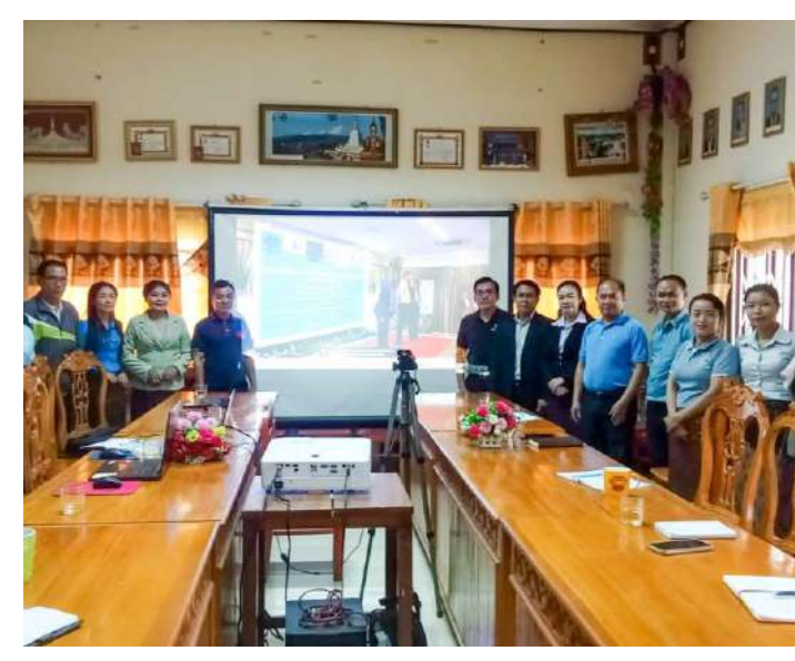
Online participation in the celebration of Lao Media Day