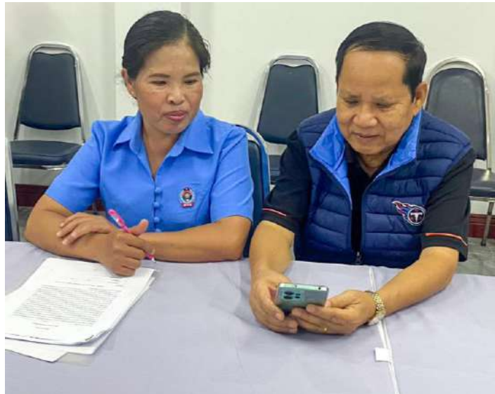
Project baseline survey in Luang Prabang Province

The data collection helped the project to determine the scope of the project's priorities, to understand the impact of the project, to be able to record important indicators, as preliminary information to monitor and evaluate the progress and effectiveness during the implementation and end of the project.