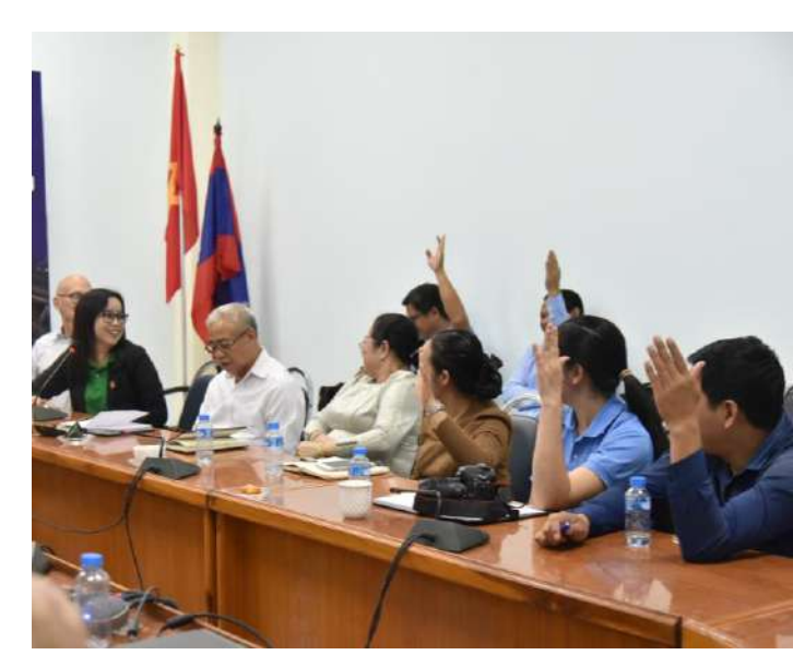
Training Need Assessment in Vientiane Capital

After the implementation is completed, LJA, CARE Laos, GAMCIL, and the technical expert have created and developed an appropriate training curriculum both offline and online through the LJA website. In addition, the project will use the curriculum to train Lao journalists to improve digital media and increase awareness access to development information related to gender and green development issues.