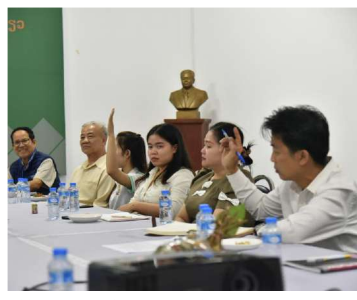
Training Need Assessment in Luang Prabang Province