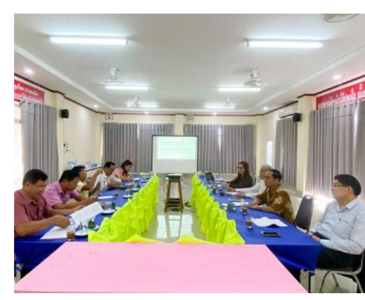
Provincial Coordination Meeting in Champasak Province

In addition, the LJA also sent a letter to select the main coordinators to the Department of Information, Culture and Tourism in three target provinces to select provincial coordinators of the project, so that they can support the coordination and implementation of activities together with the project throughout the project duration.