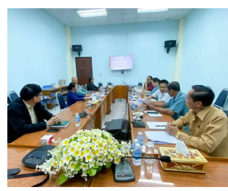
Provincial Coordination Meeting in Luang Prabang Province