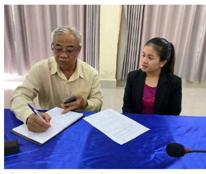
Project baseline survey in Champasak Province