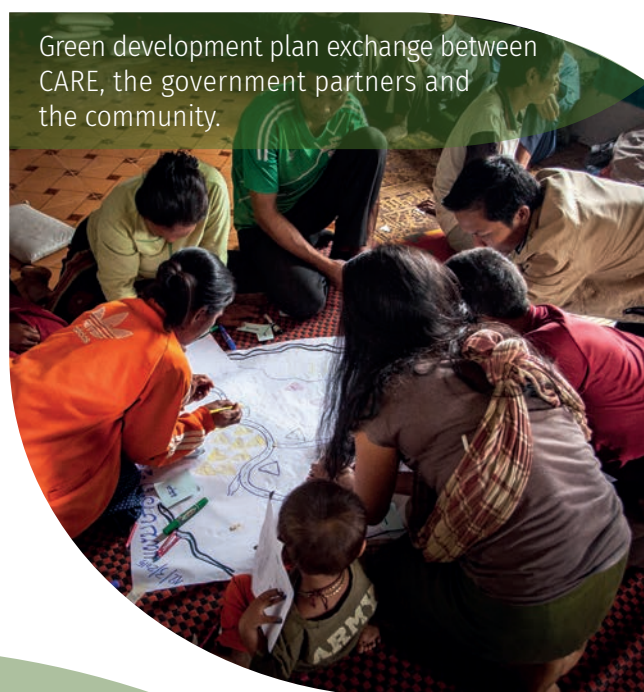
Green development plan exchange between CARE, the government partners and the community.

CARE International in Lao PDR Vientiane Office P.O Box: 4328, Nongsangthor Rd Ban Nongsangthor, Saysettha District, Vientiane, Lao PDR Tel: (+856-21) 217 727