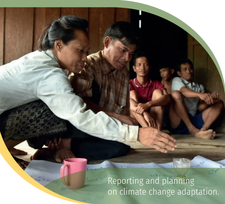
Reporting and planning on climate change adaptation.