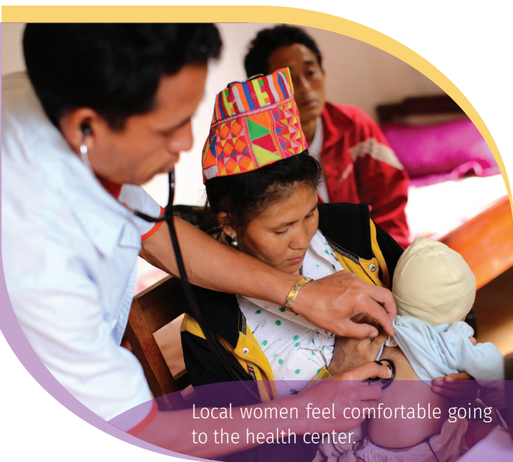
Local women feel comfortable going to the health center.