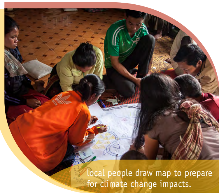
local people draw map to prepare for climate change impacts.