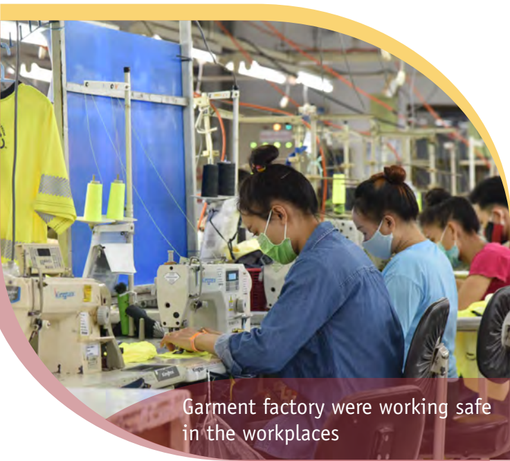
Garment factory were working safe in the workplaces